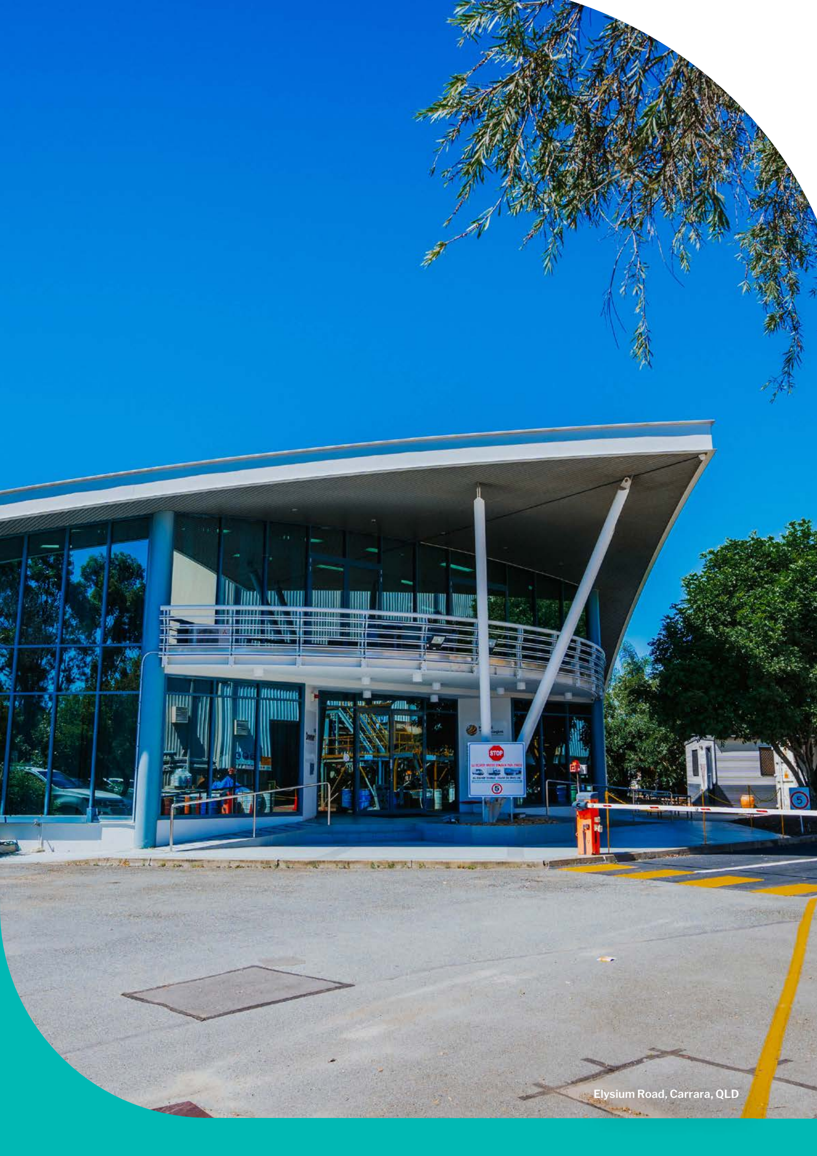
Elysium Road, Carrara, QLD